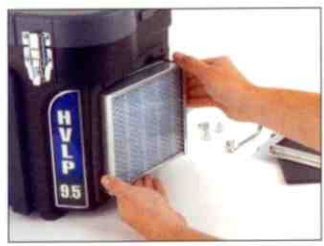
1 Remove filter