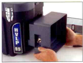
2 Slide ProComp Pack into sprayer