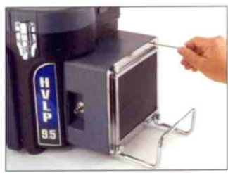
3 Reinstall filter and hose rack

Introducing the newest line to Graco's FinishPro product family of fine finish sprayers, FinishPro HVLP with breakthrough TurboForce™ technology. TurboForce is the next generation turbine technology that delivers the most optimized air pressure and air flow combination. Contractors will experience up to 30% more performance than any comparable product on the market. The more TurboForce, the faster the application with less material preparation.